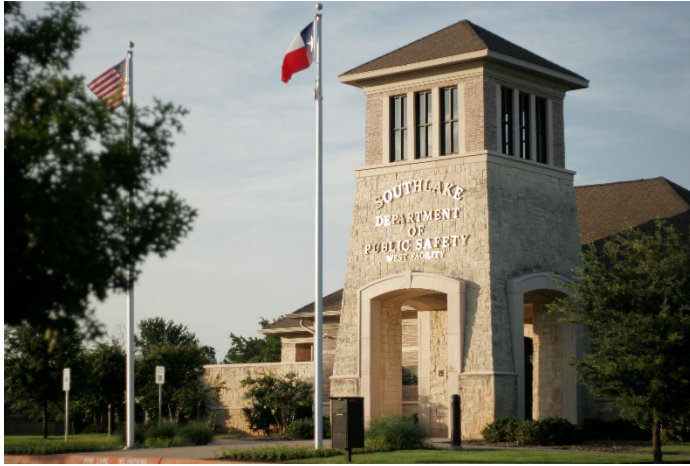
View of DPS West from the front