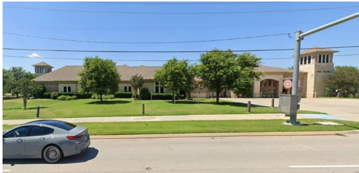
View of DPS West from Southlake Boulevard